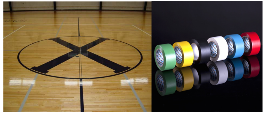
Adhesive tape on gym floor.