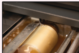
Standard Glue Tank