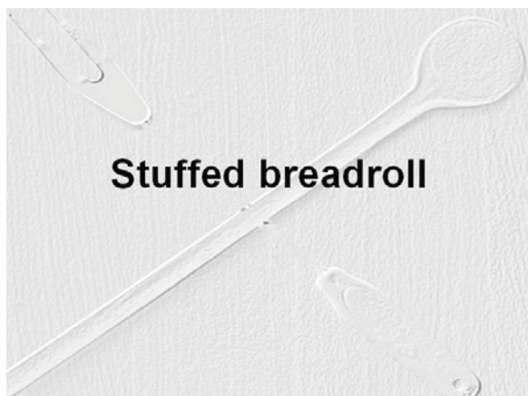
1 st slide