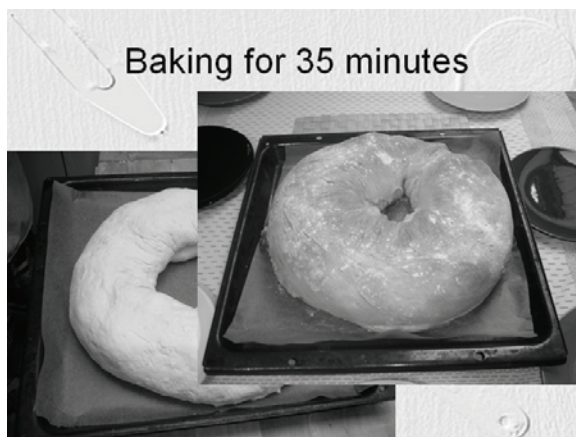
4 th slide